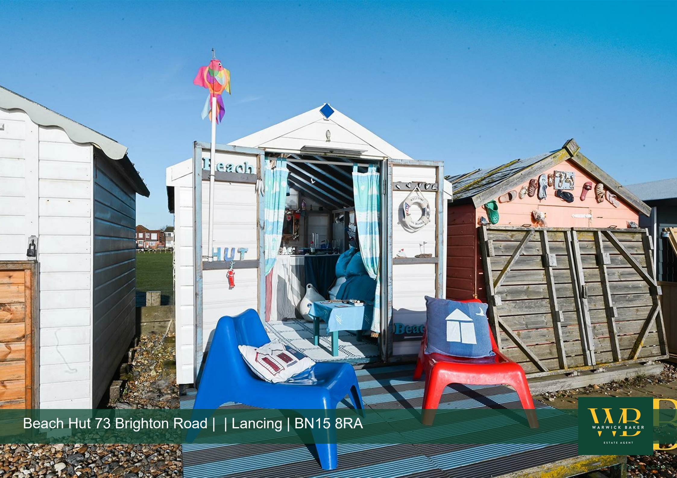
Beach Hut 73 Brighton Road | | Lancing | BN15 8RA